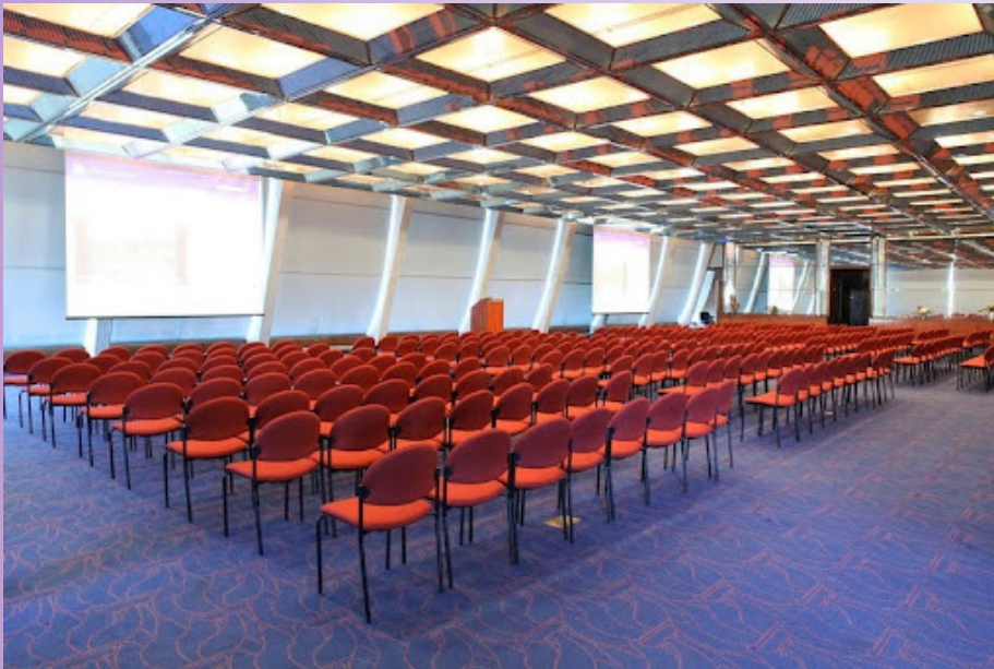
Left: Feature Plenary Hall

Partner with us to elevate your brand at the premier event for coaching and technology innovation.