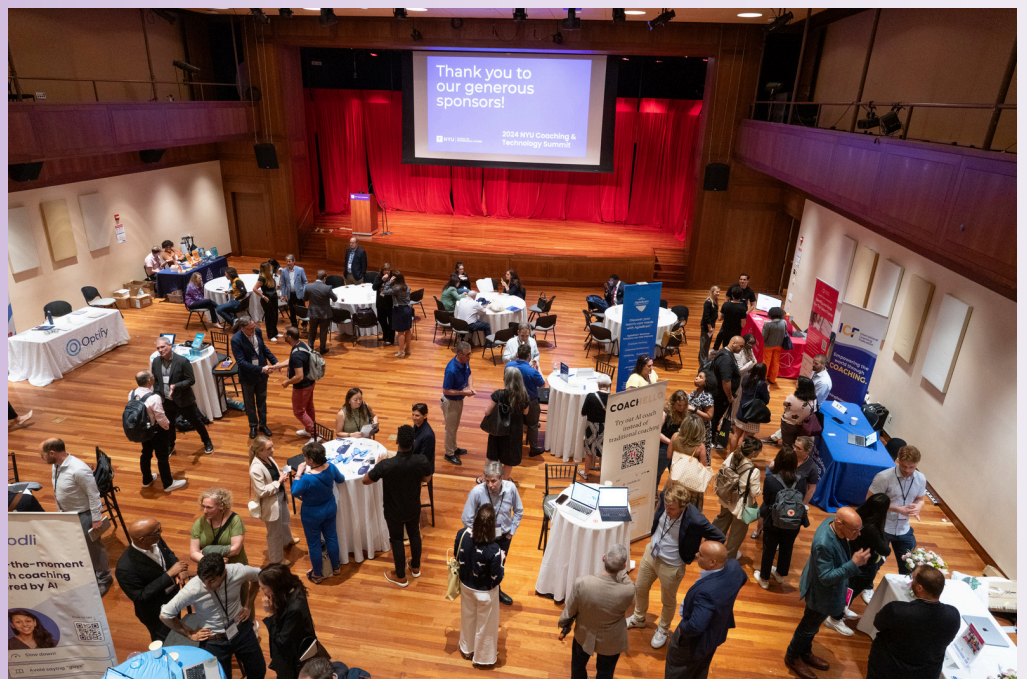
Right: Expo Hall